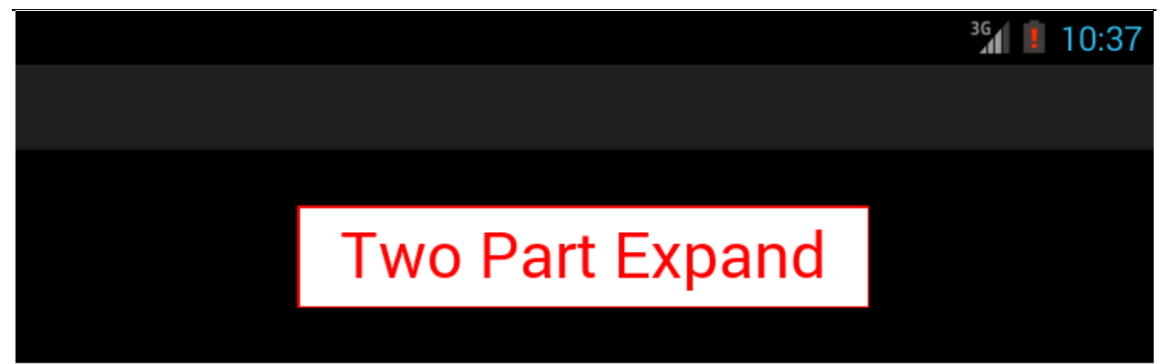
Fig 1 (Landscape) – Default state