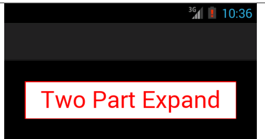
Fig 1 (Portrait) – Default state